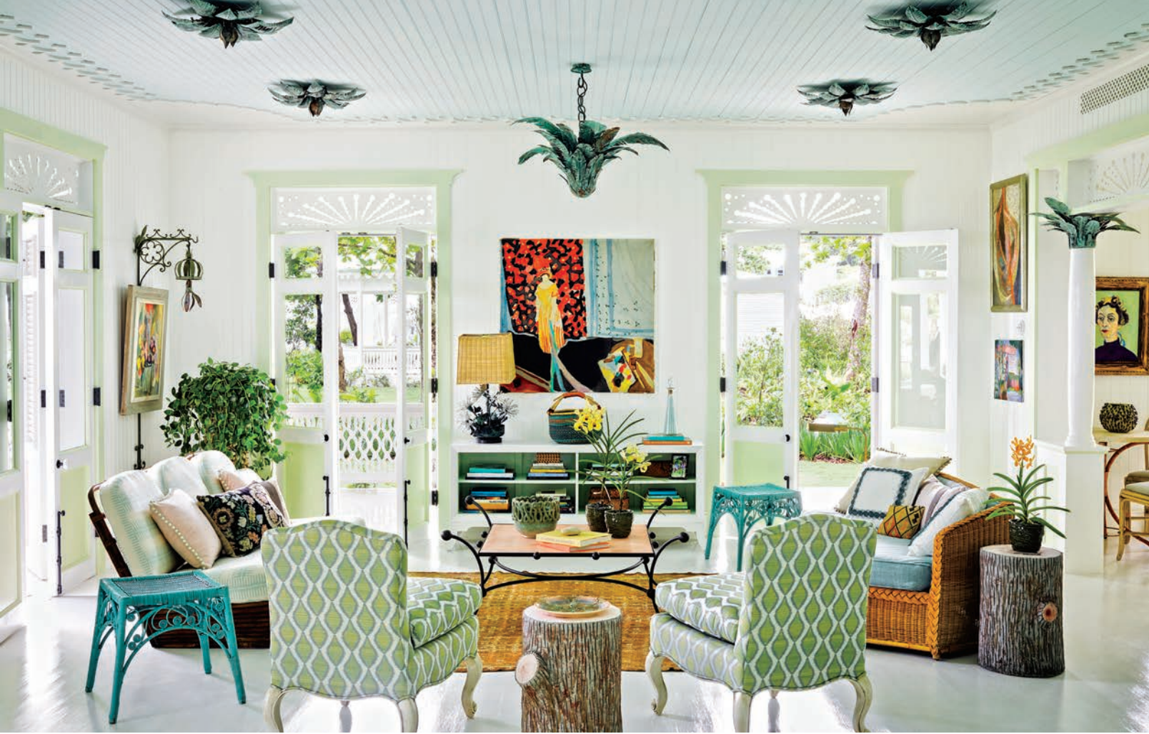
Above: The slipper chairs in the house's living room are from Celerie Kemble's line for Henredon. Below: Vintage garden chairs surround the dining table; old cabana paintings frame the folding doors, and D. Porthault linens dress the four-poster in the master bedroom beyond.