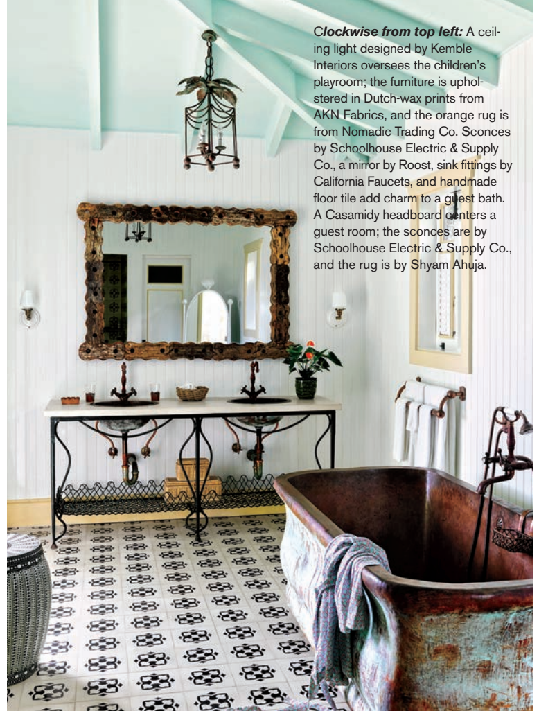
Clockwise from top left: A ceiling light designed by Kemble Interiors oversees the children's playroom; the furniture is upholstered in Dutch-wax prints from AKN Fabrics, and the orange rug is from Nomadic Trading Co. Sconces by Schoolhouse Electric & Supply Co., a mirror by Roost, sink fittings by California Faucets, and handmade floor tile add charm to a guest bath. A Casamidy headboard centers a guest room; the sconces are by Schoolhouse Electric & Supply Co., and the rug is by Shyam Ahuja.