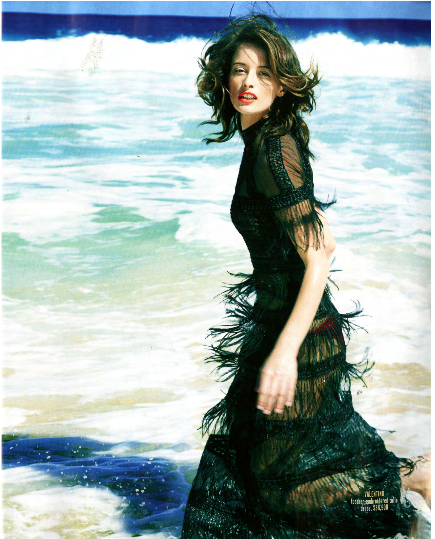
VALENTINO feather-embroidered tulle dress, $38,900